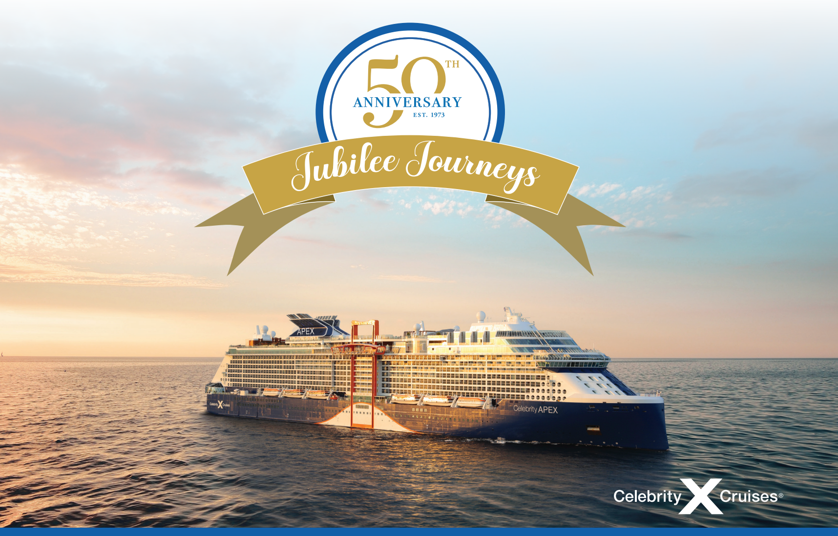
11-Night Cruise on the Celebrity Apex - Round Trip from Athens, Greece